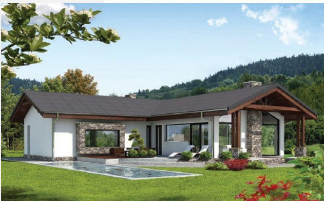
Anthracite color SCL-180MA-TC48 AN

Complete 3D drawing and dimensioning software available online: PV Designer 3D - www.suncell.ch