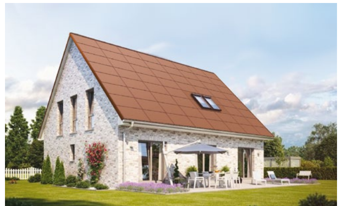
Terracotta color SCL-190M64 TC